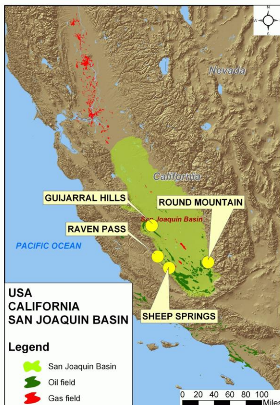
Incremental Oil and Gas project locations