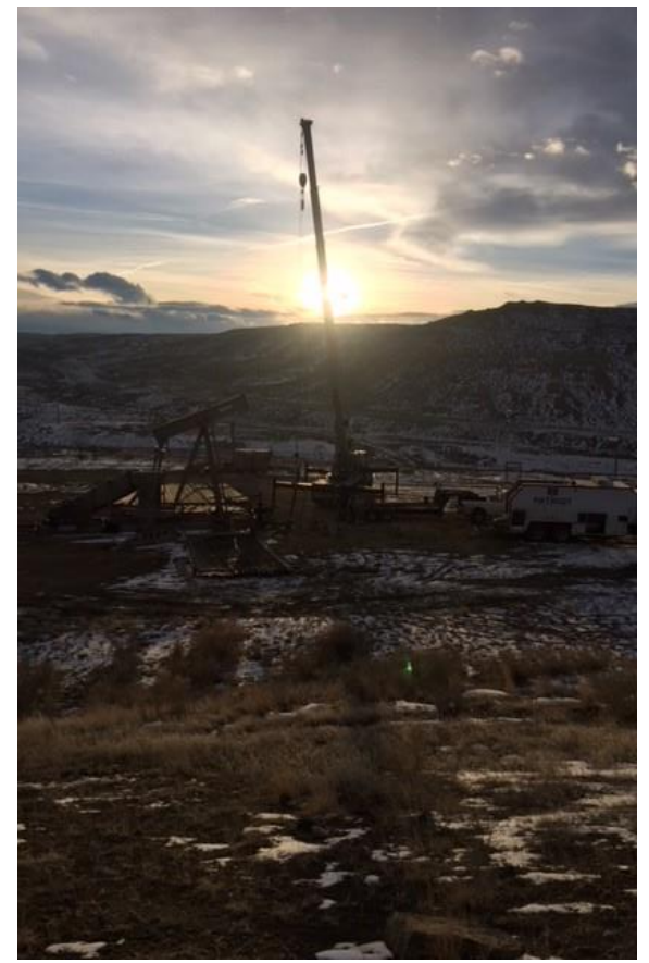
Recompletion rig, 35-28 well Silvertip Field