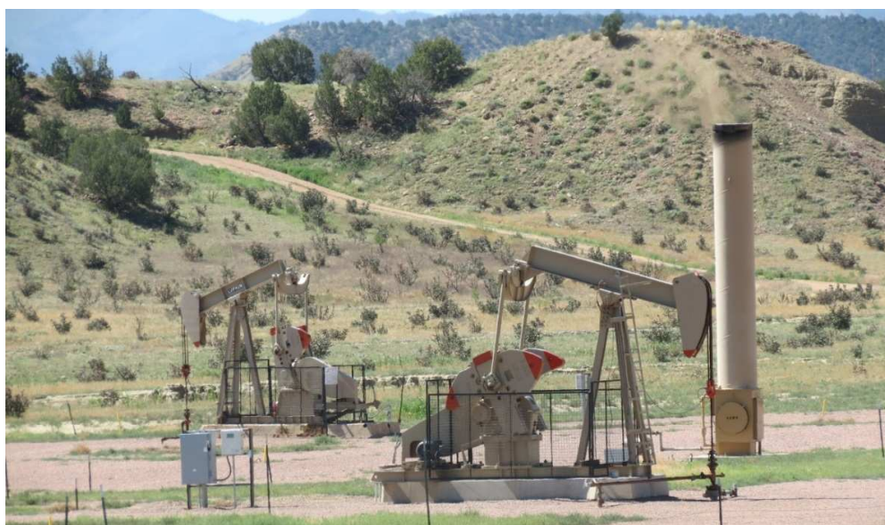
Figure 3. Two wells at the Florence Oilfield

These oilfields continue to meet the Company's asset criteria of low cost, shallow, onshore wells with low decline oil production. Secondary recovery potential of the remaining undeveloped reserves and resources continues to be assessed.