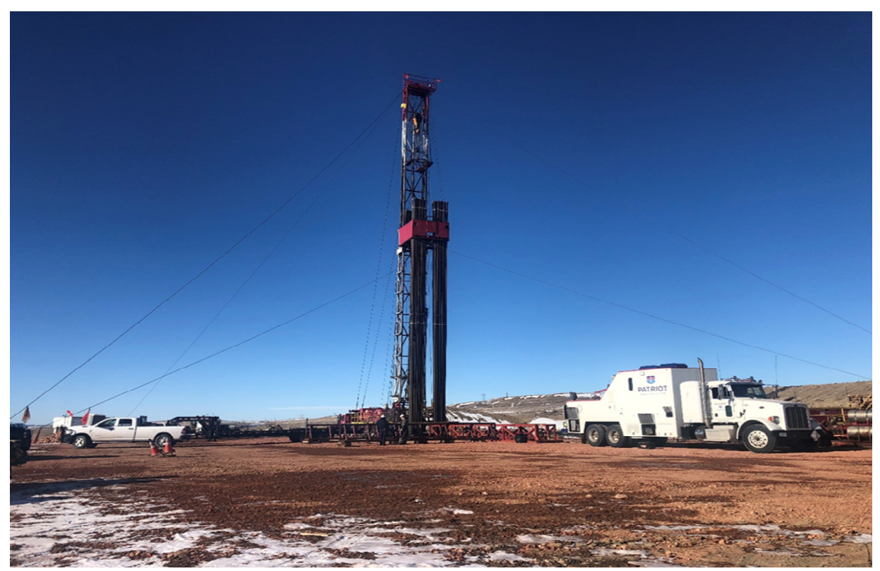
Completion rig at the Govt Kaehne #9-29 well site

Mud and wireline logs that were performed during and after the drilling phase indicated that there was a hydrocarbon bearing reservoir which contained economic quantities of producible oil (refer announcement dated 4<sup>th</sup> December). 5½" production casing was run and cemented in preparation for the well completion.