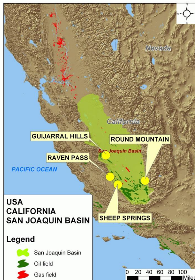
Incremental Oil and Gas project locations

IOG's focus is onshore California. The company has four current projects which are detailed on the website ( incrementaloiilandgas.com ). These projects range from the producing Sheep Springs Oilfield to low risk development projects at Round Mountain and Gujarral Hills and an exploration project at Raven Pass. IOG's strategy is to develop these and other new and yet to be secured projects into a substantial production base.