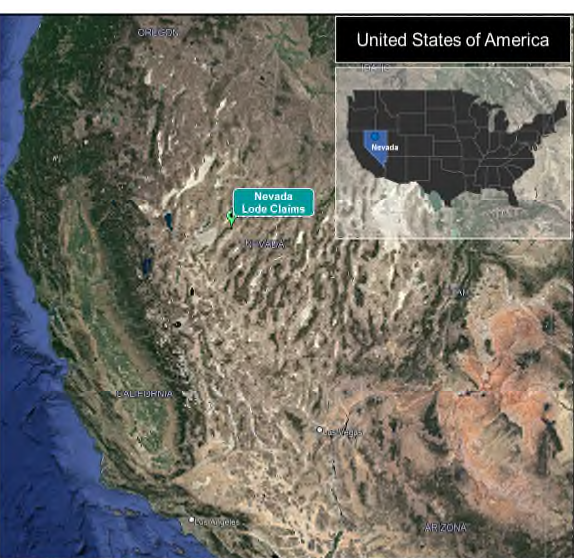
Figure 2: Location of Nevada Battery Metals Project in Nevada, USA

The Company's main objective is to create Shareholder wealth via the discovery of an economic mineral deposit utilising a systematic and science-based approach to exploration of the Group's Projects, which have been grouped by geographical area as follows: